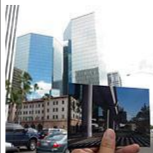
After 40-Year Battle, Train May Roll for Oahu