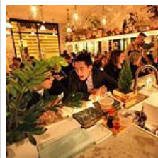
Restaurant Review: Wong