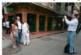
Michael Brown, in group at left, the former director of FEMA, is visiting the city that made him famous.