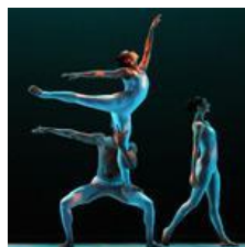
Trying Always to Please, Rarely to Challenge