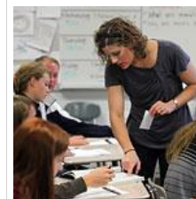
Teachers in Idaho Resist High-Tech Push