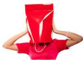
THE RETAIL DIARIES

Department Store Dispatch: It's Raining Jimmy Choos