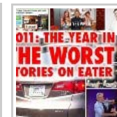
Year in Eater 2011: