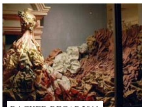
RACKED RECAP 2011

Department Store Dispatch: It's Raining Jimmy Choos